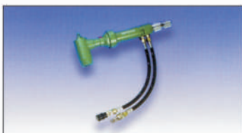
Picture : Hydraulic corner Drill 2 180610