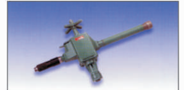
Picture : Drills 2 1289 0030: Automatics Stop Twist Throttle