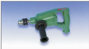
Picture : Drill 2 1310 0010: internal Value Latch